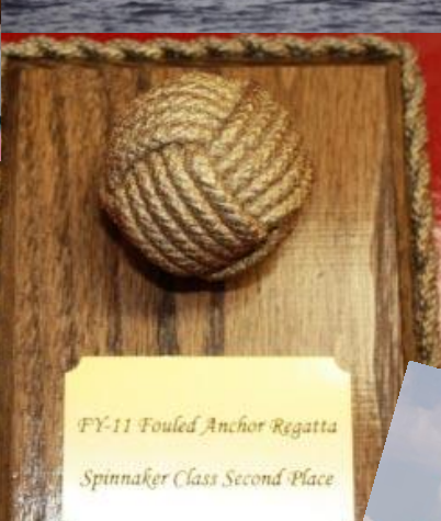
FY-11 Fouled Anchor Regatta Spinnaker Class Second Place