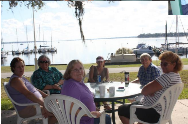
...and of course, there was football!