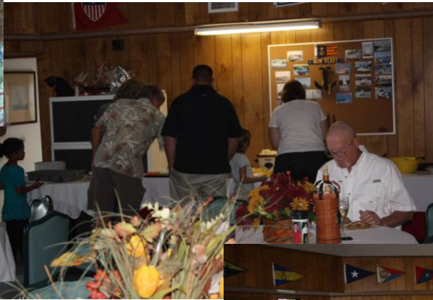
members, families and friends gathered to celebrate Thanksgiving